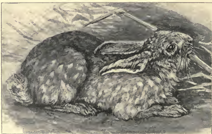
FIG. XL. LEPUS ALLENI . ALLEN'S JACK RABBIT.

Lepus alleni Mearns, Bull. Am. Mus. Nat. Hist. N. Y., 1890, p.